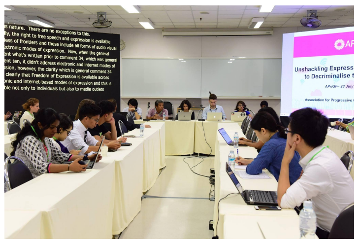
APrIGF 2017: live scribe screen on the left

2019 Meeting Archive Reference: https://2019.aprigf.asia/archive/